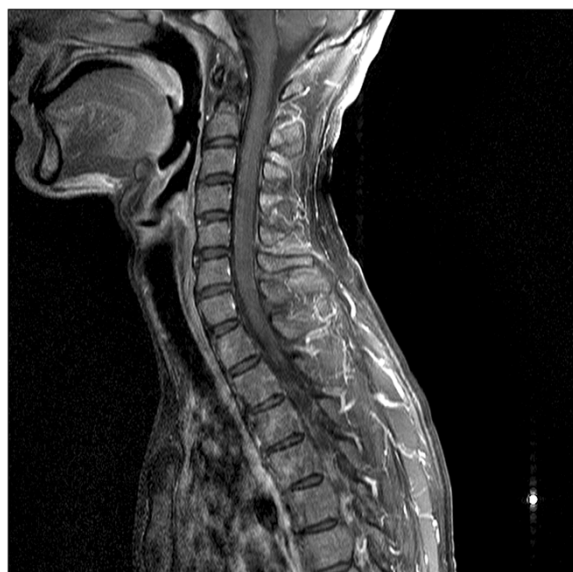
Figure 2 Magnetic resonance imaging scan of the spine from May 2011. The magnetic resonance imaging scan acquired in May 2011 indicated no evidence of osteitis in the cervical spine.

but all medication was stopped after that period. His condition has been stable without any recurrence of the hematologic disease.