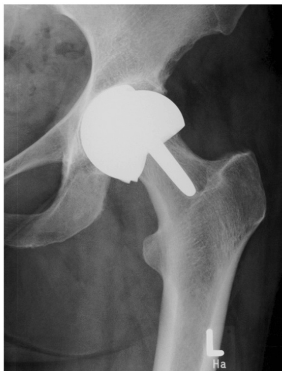
Figure 1 Early failure of hip resurfacing arthroplasty three years after implantation.

revealed a failure of the acetabular component, which was already dislocated, and additionally showed a narrowing of the femoral neck (Figure 1). For those reasons, our patient underwent revision surgery. Intra-operatively, a massive metallosis of the peri-prosthetic tissue was found and the femoral and acetabular components were already