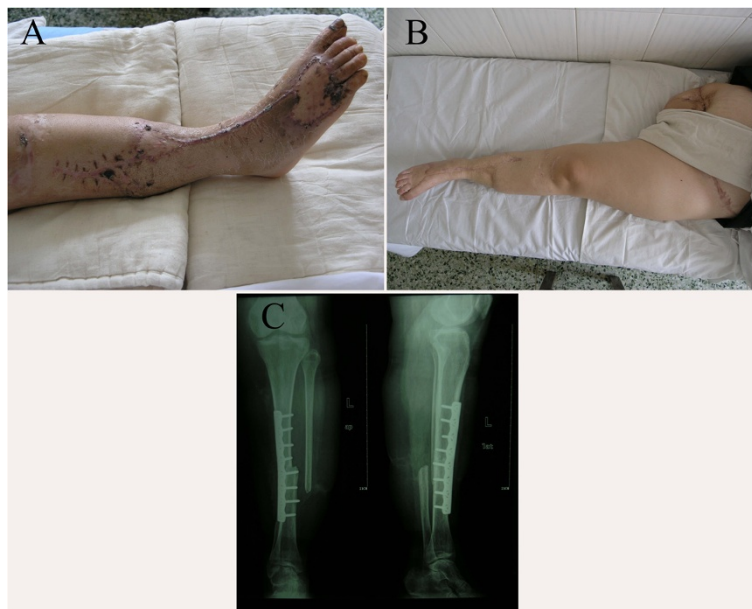
Figure 2 Post-operative status of our patient. (A) One month post-operatively. (B) Three years and three months post-operatively. (C) X-ray image taken at 12 months post-operatively.

The replantation was successful and our patient was discharged after two months (Figure 2A). She was rehabilitated with a contralateral prosthesis and ambulates