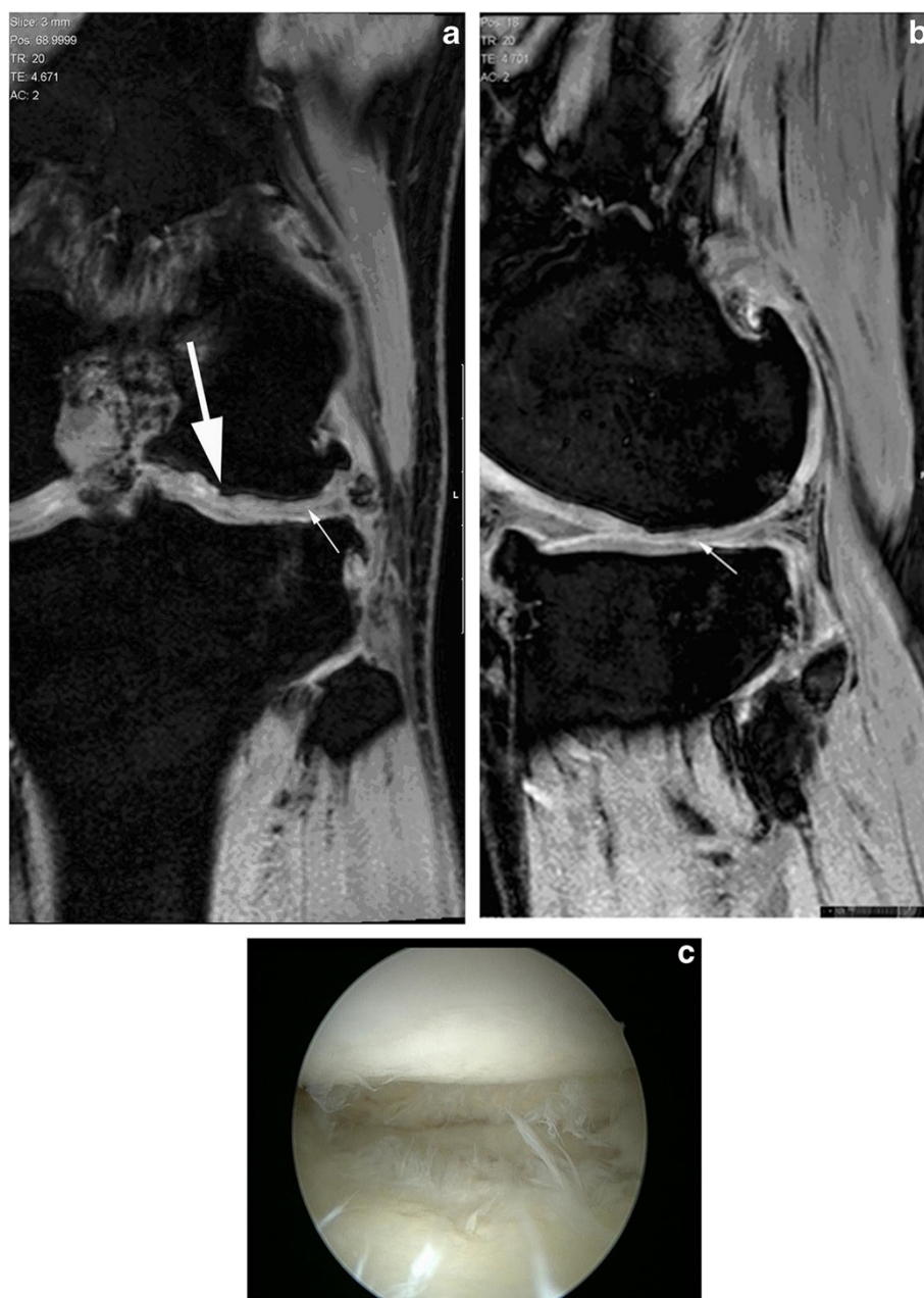
Figure 2 Second year follow-up magnetic resonance imaging. (a) Coronal and (b) sagittal three-dimensional gradient echo T1 (WATSf; repetition time 20, echo time 5.2, field of view 150, fractional anisotropy 15°, slice thickness 3 mm) left knee magnetic resonance images demonstrate the morphology of the cartilage implant. The graft is well integrated with a thickness that is similar to that of the adjacent cartilage; the graft surface is smooth (arrow). Mildly decreased signal intensity and artifacts are observed in the graft compared with the adjacent cartilage. Underneath, the large graft irregular bone contour (thick arrow) and osteophyte formation at bony margins is also noted. (c) Second-look arthroscopy at two years demonstrated complete filling of the defect and excellent integration of the newly formed cartilage with native tissue.

stimulation techniques [5]. However, donor site morbidity following the treatment of large defects may limit clinical usage of this method. Bentley et al. showed significant superiority of ACI over mosaicplasty for the repair of knee articular cartilage defects in a prospective, randomized, clinical trial with 60 patients [6]. Modified Cincinnati and Stanmore scores and objective clinical