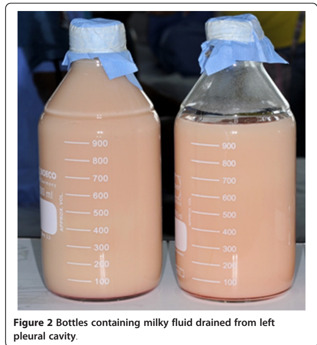
Figure 2 Bottles containing milky fluid drained from left pleural cavity.

Thoracentesis yielded a milky fluid (Figure 2) with a total protein level of 1.6g/dL, albumin 0.9g/dL, glucose 130mg/dL, lactate dehydrogenase (LDH) 128U/L, triglyceride 475mg/dL, cholesterol 39mg/dL and an adenosine deaminase (ADA) level of 40.6U/L (normal <45U/L). The cell count of the pleural fluid was 78 cells/mm 3 with 55% lymphocytes and 29% neutrophils. Abdominal paracentesis also revealed a milky fluid and showed a total protein level of 1.7g/dL, albumin 0.9g/dL, triglyceride 535mg/dL and a cell count of 160 cells/mm 3 with 79% lymphocytes and 16% neutrophils. All tests for M. tuberculosis , bacteria, and fungi from the pleural and