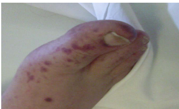
Figure 1 Vasculitic lesions on the leg during the first day after lenograstin injection.

(Figure 6). CBCs (complete blood count) revealed haemoglobin: 10 gm/dl, TLC 2000/ul(persistently) and platelet count 150,000/ul. The immune screen for cryoglobulins, cryofibrinogens, ANCA (antineutrophilic cytoplasmic antibodies), cold agglutinin, ANA (anti-nuclear antibodies), lupus anticoagulant and anticardiolipin were all negative. Tests revealed a PT (prothrombin time) of 19 seconds, PC (prothrombin concentration) of 56% INR (international normalized ratio) as 1.7 and a PTT (partial thromboplastin time) of 35 seconds. Fibrinogen repeatedly was normal. D (domain) dimer, carried out at 72 hours, was 4000 ng/ml. Protein electrophoresis showed hypoalbuminemia with increased \beta globulin. C3 was normal but C4 was consumed. No fragmented red blood cells (RBCs) were seen in blood film. CRP(C reactive protein) was 0.5 ( n < 0.5 ), anti-HCV (anti hepatitis C virus antibodies) abs, HBs antigen and HBc antibodies were all negative. Serum viscosity was normal. Magnetic resonance imaging (MRI) of the patient's brain revealed age related brain involutional changes and a few tiny bilateral cerebral ischemic foci. Serum chemistry and electrolytes