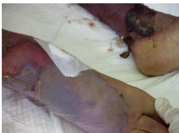
Figure 5 The legs after 10 days of onset of treatment.

which included infection, cryoglobulinemia and medications [2]. The association between lymphoma and vasculitis is rare in general. Lymphoproliferative disorders are the most common hematological malignancies associated with vasculitis (20%) especially hairy cell leukemia. Cases of vasculitis with CLL are rare (0.1 to 2%) [3]. The mechanisms of development of vasculitis in CLL include 1) immune complexes, 2) activation of B-lymphocytes, 3) antibodies directed toward endothelial antigens, 4) the direct effect of a malignancy on the vascular wall, 5) adverse reactions to anticancer drugs, and 6) CD5-positive B cells present in CLL may produce auto antibodies and monoclonal immunoglobulins with various autoantibody activities [4].