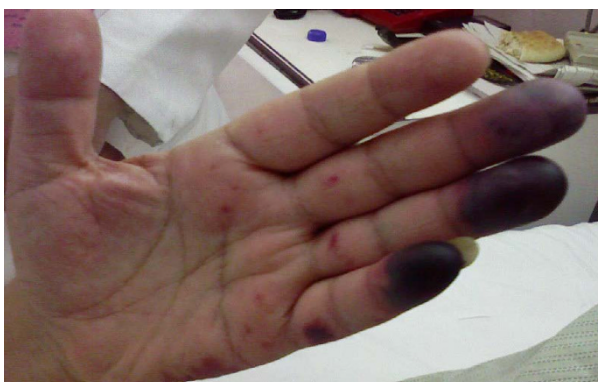
Figure 2 Vasculitic lesions on the hand in the second day.

(Figure 6). CBCs (complete blood count) revealed haemoglobin: 10 gm/dl, TLC 2000/ul(persistently) and platelet count 150,000/ul. The immune screen for cryoglobulins, cryofibrinogens, ANCA (antineutrophilic cytoplasmic antibodies), cold agglutinin, ANA (anti-nuclear antibodies), lupus anticoagulant and anticardiolipin were all negative. Tests revealed a PT (prothrombin time) of 19 seconds, PC (prothrombin concentration) of 56% INR (international normalized ratio) as 1.7 and a PTT (partial thromboplastin time) of 35 seconds. Fibrinogen repeatedly was normal. D (domain) dimer, carried out at 72 hours, was 4000 ng/ml. Protein electrophoresis showed hypoalbuminemia with increased \beta globulin. C3 was normal but C4 was consumed. No fragmented red blood cells (RBCs) were seen in blood film. CRP(C reactive protein) was 0.5 ( n < 0.5 ), anti-HCV (anti hepatitis C virus antibodies) abs, HBs antigen and HBc antibodies were all negative. Serum viscosity was normal. Magnetic resonance imaging (MRI) of the patient's brain revealed age related brain involutional changes and a few tiny bilateral cerebral ischemic foci. Serum chemistry and electrolytes