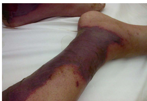
Figure 4 Progression of vasculitic lesions on the lower limb after 4 days.

This case is considered unusual and the pathogenesis is not fully understood as the described vasculitis does not typically develop in this context with granulocytic colony-stimulating factor (G-CSF) treatment. Cutaneous vasculitis was reported in less than one in 7000 of those treated with G-CSF, and was moderate to severe in intensity. Most patients had severe chronic neutropenia and were on long-term G-CSF therapy. Symptoms developed with an increase in the absolute neutrophilic count (ANC) and stopped when the ANC decreased and the patients continued treatment at a reduced dosage [1]. Regarding the association of vasculitis with hematological malignancies, in a study done on 95 patients with hematological malignancy it was found that 22% had cutaneous vasculitis, 39% developed it concomitantly with malignancy, 26% of these before development of a malignancy and 35% after diagnosis of a malignancy. In 61% the vasculitis was explained only by the malignancy and in the remaining 39% it was explained by other factors,