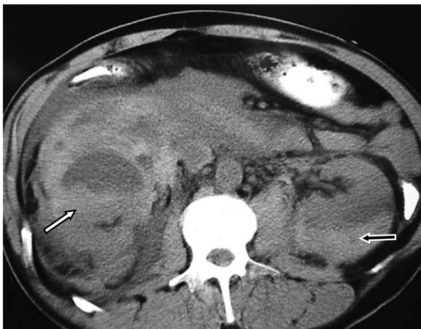
Figure 1 Computed tomography scan demonstrating an extended right retroperitoneal hematoma (white arrow) combined with a left subcapsular renal hematoma (black arrow).

and total absorption of the left subcapsular hematoma (Figure 3).