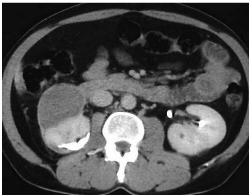
Figure 3 The six-month follow-up computed tomography scan shows total elimination of the left subcapsular hematoma and a significant reduction of the retroperitoneal hematoma on the right.

spontaneous rupture of the kidneys due to the high incidence of underlying malignancies [10]. Such an approach, however, might lead to a number of unnecessary nephrectomies.