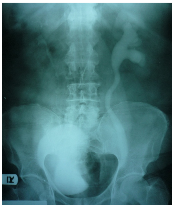
Figure 1 Preoperative intravenous pyelogram showing left hydroureteronephrosis.

A diagnosis was made of a large inguinal hernia with pressure effects on the urinary system, resulting in hematuria and obstructive hydroureteronephrosis; the abdominal wall was thus opened with a classic inguinal incision. The contents of his hernial sac, including his sigmoid colon and its mesentery, were adhered to the surrounding tissues. An attempt to reduce the content of his hernial sac was unsuccessful, so a low midline incision was made for better exposure and reduction.