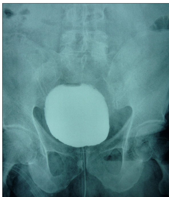
Figure 3 Postoperative cystogram showing reversal of all prior radiological signs.

symptoms. Regardless of size, an inguinal hernia may impart pressure onto proximal nerves, leading to a range of symptoms. These include generalized pressure, local sharp pains and referred pain. Lastly, neurogenic pains may be referred to the scrotum, testicle or inner thigh. A change in bowel habits or urinary symptoms may indicate a sliding hernia consisting of intestinal contents or involvement of the bladder within the hernia sac [3].