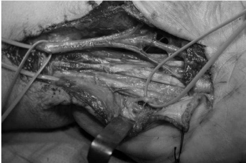
Figure 4 The flexor tendons and the median and ulnar nerves are identified and protected.

the correct diagnosis in 94% of cases [1]. The tumors lie in close approximation to important neurovascular structures and tendons, which makes the operation very demanding.