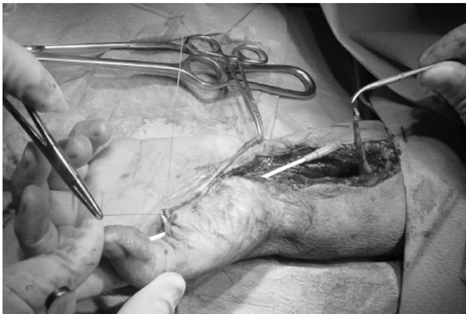
Figure 5 Reconstruction of the Flexor Pollicis Longus tendon with an intercalated autograft of Palmaris Longus tendon.

The need for a thorough clinical examination and a sound intra-operative investigation of all anatomical structures involved in the carpal tunnel release operation is of paramount importance. Although treating physicians may consider this type of operation a simple one, a high suspicion index concerning tissue involvement in