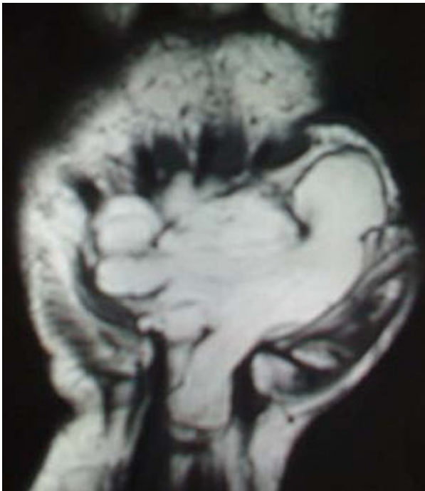
Figure 2 MRI picture showing one of the recesses invading the carpal tunnel.

this kind of tumor might be an indication of a high rate of misdiagnosis. Apart from cosmetic reasons the only indication for surgical treatment is the existence of complications arising from compression of local neurovascular structures which is a high occurrence in the narrow