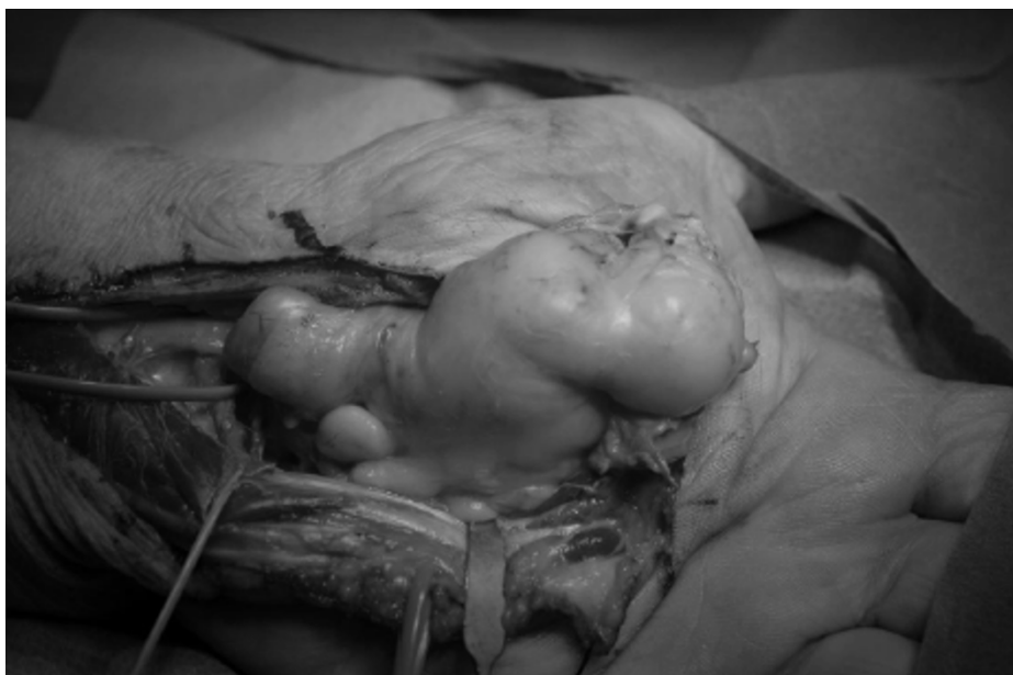
Figure 3 The lipoma was excised en block.