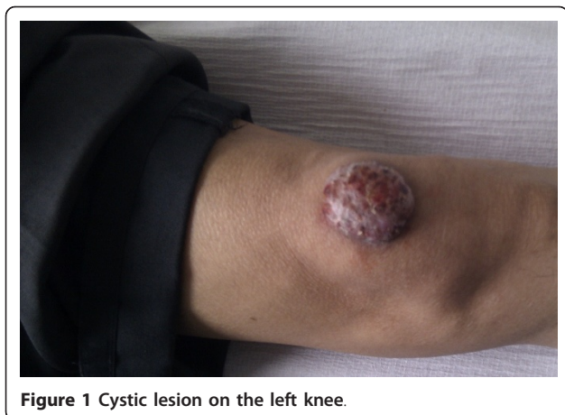
Figure 1 Cystic lesion on the left knee.