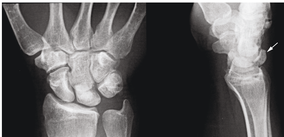
Figure 1 Posteroanterior and lateral radiographs showing that the patient had Lichtman grade III Kienböck's disease with a large, displaced dorsal fragment.