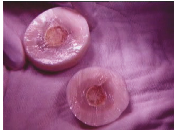
Figure 3 Macrograph of giant loose body (cut surface) showing peripheral white & central yellow portions resembling a boiled egg.

(parasitized) to the omentum (Figure 2). In addition, part of the appendices epiploicae, attached to his sigmoid colon, were calcified with constricted stalks. The peritoneal loose body was largely parasitized to the omentum with a separate feeding vessel supplying it from the omentum.