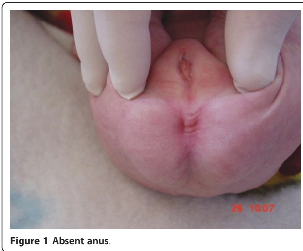
Figure 1 Absent anus.

karotyped and photographed, showing 46,XX,del(3)(q29) (Figure 2).