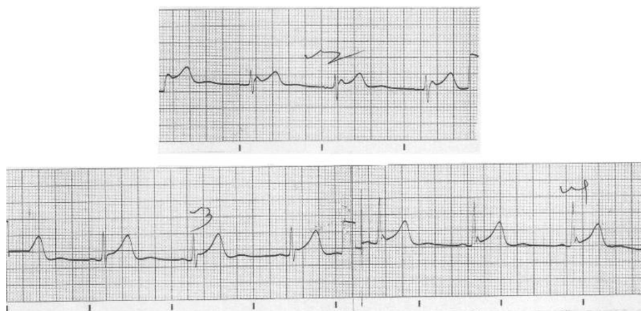
Figure 1 Electrocardiogram (ECG) obtained at the time of admission showing sinus bradycardia with J waves .

In addition to these mechanisms, NT has been recognized as a mediator of hypothermia. In schizophrenia, thermal regulation is altered. This may be explained by changes in NT levels. NT is one of the most important thermoregulatory peptides that also play a role in the antipsychotic actions of APDs. In patients with schizophrenia, NT concentration in the cerebrospinal fluid (CSF) is low and is usually normalized following antipsychotic drug use [10]. The hypothermic reaction is also