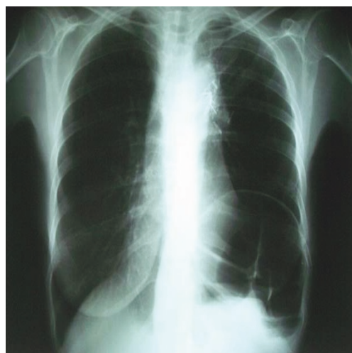
Figure 2 Chest radiograph taken on the day of the thrombus diagnosis.

Our patient was clinically diagnosed with SVCS, and contrast-enhanced computed tomography (CT) was performed to confirm the diagnosis. Enhanced neck CT demonstrated a major thrombus-like lesion inside her right jugular vein (Figure 3). The standard therapeutic treatment modality for SVCS is radiotherapy, but because of the CT angiography findings, our patient was