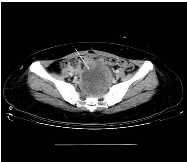
Figure 1 A large low-density mass lesion was noted in the pelvic cavity and a significant mass effect at rectosigmoid and bladder was also noted (arrow).

(Figure 2C). Immunohistochemical studies showed that CK7 and CD10 staining were positive but that the CK20 staining was negative. After one and a half months in our department, she recovered uneventfully and was transferred to the division of medical oncology for chemotherapy. Chemotherapy, with regimen of bleomycin, etoposide and cisplatin, was arranged but pancytopenia with nosocomial infection was noted after the chemotherapy. Due to the poor response to systemic