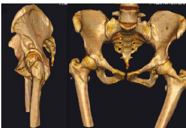
Figure 4 CT reconstructions demonstrating erosion of left femoral neck and pelvis.

The suggested mechanism for dislocation for the majority of cases has been related to the intra-articular growth of neurofibromas [4,5,8,10,13]. Local neurofibromas can lead to deformity of the pelvis, erosion of the