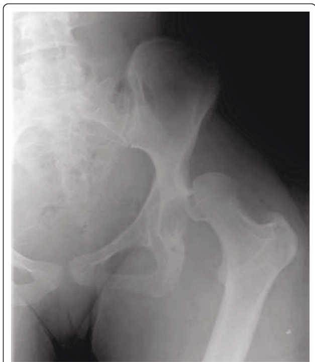
Figure 1 Radiograph of dislocated left hip.

Neurofibromatosis type-1 is a common genetic disorder that can have both focal and generalized skeletal manifestations. Generalized skeletal manifestations such as osteoporosis and short stature are common. Focal abnormalities such as tibial dysplasia, short angle scoliosis and sphenoid wing dysplasia, although less common, are well documented in the literature. However, there is