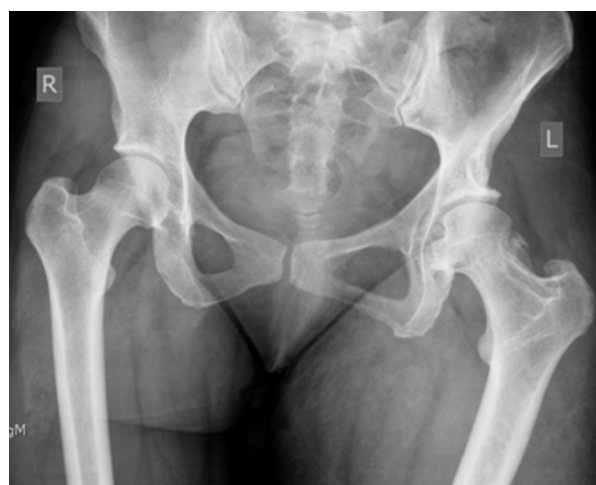
Figure 5 Radiograph of pelvis demonstrate left hip to be in joint.

a relative paucity of reported cases of pathological hip dislocation in patients with NF-1, with only 12 documented cases found in the published literature. Six dislocations occurred following trivial trauma [4-8] and six cases were deemed atraumatic [9-13].