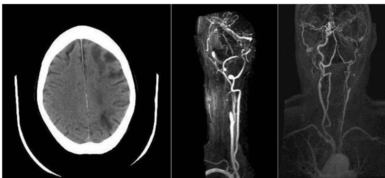
Figure 1 Watershed infarcts in the anterior cortical, posterior cortical and internal watershed territories of the left cerebral hemisphere. Magnetic resonance angiogram shows complete occlusion of the left internal carotid artery.

PET scanning is unique because it provides absolute measurements for both OEF and CBF, but is cumbersome and not widely available. Other modalities, such as the BOLD-contrast fMRI used here, establish a measurement of rCBF either by comparing the affected hemisphere to the contralateral (normally perfused) hemisphere or by utilising normative reference ranges. Single Photon Emission CT (SPECT) and Xenon-