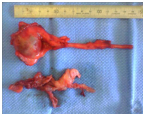
Figure 3 Gross specimen of a 4 \times 3 \times 3 cm thick-walled cyst seen in continuity with the tip of the appendix. Immediately below the 15-cm ruler in the photograph. Membranes of the remainder of the multiloculated cyst after removal from the appendix are seen lying toward the bottom of the photograph. The cyst had ruptured in transit from the operating table to the specimen photography table in the operating room.

from the larger cyst (Figure 3). We concluded that the radiological drain had entered one of these cysts. Histological analysis revealed cysts lined with flattened mesothelial cells, and the walls were composed of loose connective tissue with occasional chronic inflammatory cells (Figure 4). These findings were consistent with a histological diagnosis of a multiloculated benign cystic mesothelioma. The appendix showed resolving appendicitis with perforation at the tip. The patient was discharged well on the second postoperative day and was also well at six-week and three-month follow-up.