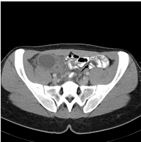
Figure 1 Axial CT image showing a loculated cystic mass in the right pelvis which appears to contain the tip of the appendix.

right iliac fossa. Unusually, 30 ml of serous fluid but no pus was aspirated. The drain was removed after three days with no further output. Drained fluid was sent for culture, and peripheral blood cultures showed no growth after 72 hours of incubation. After five days, intravenous antibiotics the patient was clinically well. She was discharged and readmitted two weeks later for an interval diagnostic laparoscopy, as we were now suspicious of a non-infective pathology based on the drain output. The patient consented to an appendicectomy if no other pathology was found.