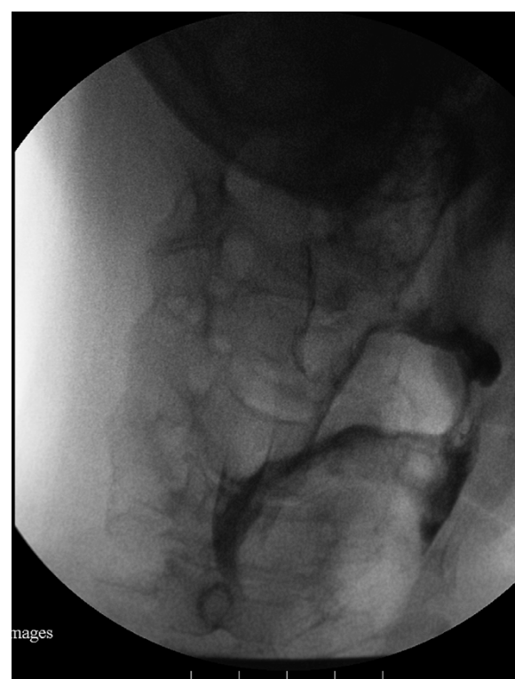
Figure 3 Videofluoroscopic image, anteroposterior projection, with the head rotated to the left side. Residues decreased in volume and no aspiration was detected.

previous studies [8]. Further monitoring of MG-related dysphagia could be necessary after other symptoms improve.