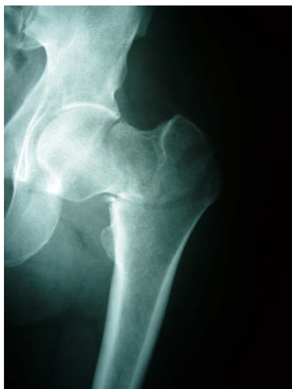
Figure 1 Pertrochanteric fracture combined with subcapital fracture on preoperative anteroposterior radiograph of the left hip.

anti-rotational cannulated screw (Figure 2). To prevent the development of rotational forces to the femoral head during drilling or lag screw insertion, an eccentric temporary guide wire was inserted into the femoral head and the acetabulum before drilling, and removed after the insertion of the lag screw.