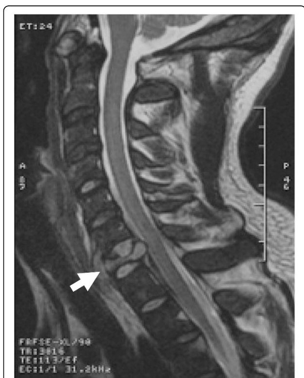
Figure 1 Pre-operative imaging with MRI demonstrating destruction and collapse of the C7 body (A). Compression of the spinal cord in the epidural space is shown with distortion of the cord at this level.

Post-operatively, early mobilization while wearing a cervical collar was encouraged. Collar immobilization was continued in the weeks following surgery as he underwent chemotherapy. He had a near-complete return of strength in his extremities without residual post-operative sensory deficits. Post-operative imaging revealed proper alignment and stability of cage placement with excellent restoration of the spinal canal patency and subarachnoid space (Figure 2). Following a short period of post-operative recovery, the patient was started on an initial cycle of a CHOP chemotherapy regimen (Per cycle, Day 1: cyclophosphamide 750 mg/m 2 IV, doxorubicin 50 mg/m 2 IV, vincristine 1.4 mg/m 2 IV; Day 1-5: prednisone 100 mg po) to treat his adjacent