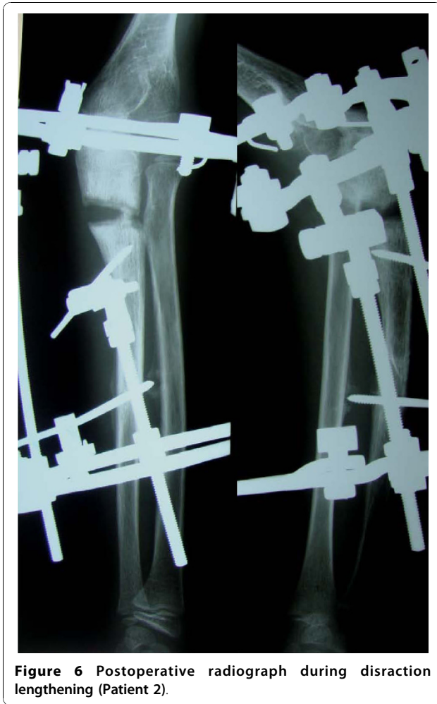
Figure 6 Postoperative radiograph during distraction lengthening (Patient 2).