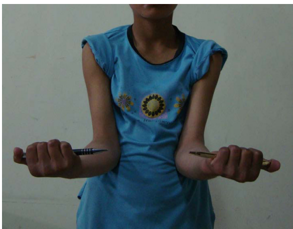
Figure 9 Supination at elbow.

The advantages of distraction treatment can be summarized as: minimally invasive surgery, controlled lengthening, no radiocapitellar intervention, no need for bone grafting, and early resumption of functional exercises. The only difficulty encountered during the process