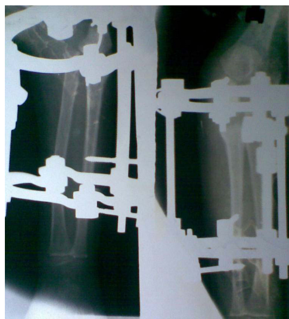
Figure 5 Postoperative radiograph after application of Ilizarov fixator and ulnar osteotomy (Patient 1).

At follow-up two years after surgery, both patients had an excellent result and 100% range of motion around the affected elbow (Figures 9, 10).