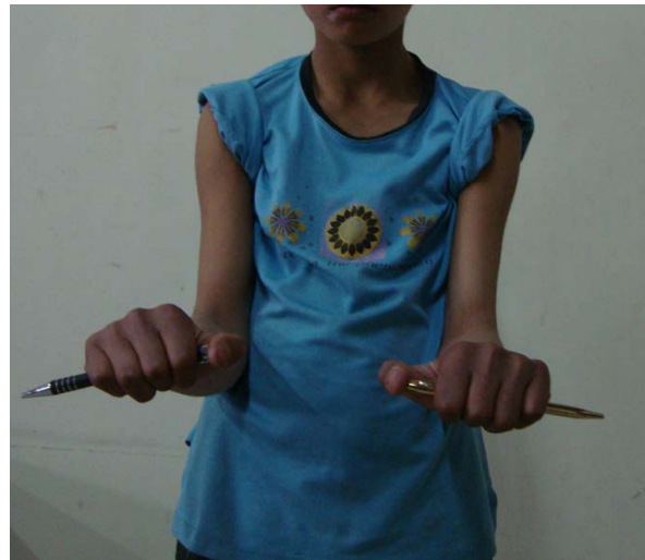
Figure 10 Pronation at elbow.

of correction in our patients was the radiologic interpretation of the relocation of the radial head, because of the superimposing proximal steel ring; however, this problem can be easily managed by the use of carbon fiber radiolucent rings.