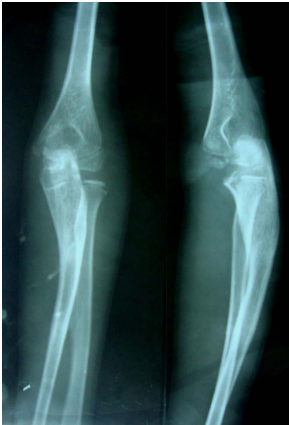
Figure 8 Radiograph taken at the final follow-up visit showing relocation of the radial head (Patient 2).

The advantages of distraction treatment can be summarized as: minimally invasive surgery, controlled lengthening, no radiocapitellar intervention, no need for bone grafting, and early resumption of functional exercises. The only difficulty encountered during the process