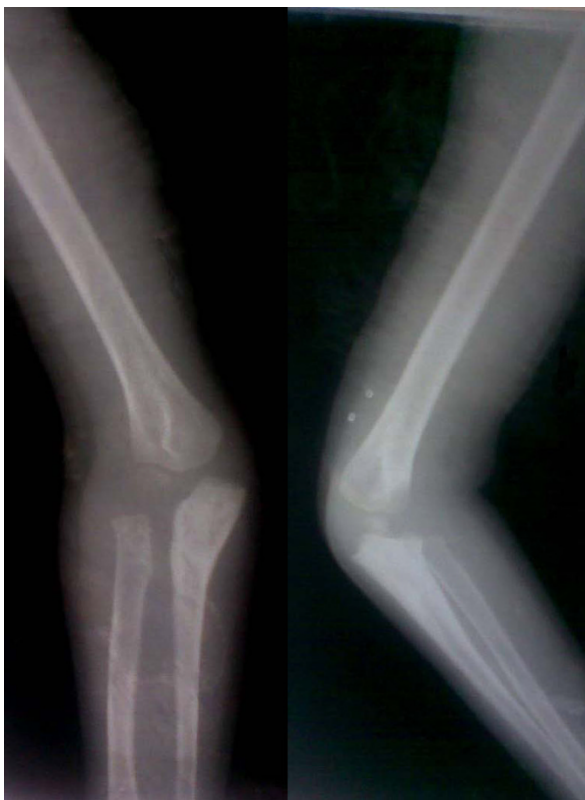
Figure 1 Preoperative radiograph of patient 1 showing Monteggia fracture dislocation (Patient 1).

The surgery was undertaken under general anesthesia. A two-ring construct with hinge application was used. The ring was fixed only to the ulna, to allow free supination and pronation movement. The proximal ring was fixed with an Ilizarov wire and one half-pin. The distal ring was fixed by two half-pins in different planes on the subcutaneous border. Through an incision 15 mm long, a low-energy corticotomy of the ulna was performed at the proposed site (Figure 5). We did not make any attempt to hyperangulate the osteotomy intraoperatively. Distraction was started on the seventh day