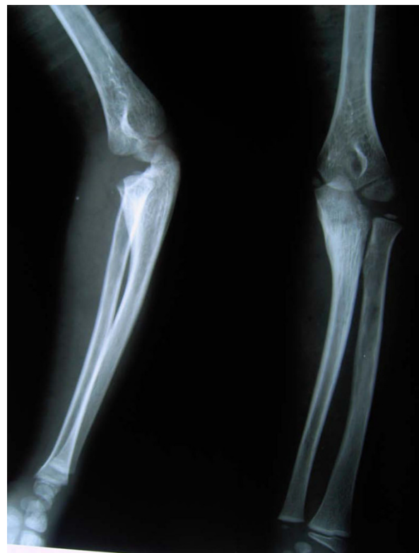
Figure 2 Preoperative radiograph showing radial head dislocation (Patient 2).