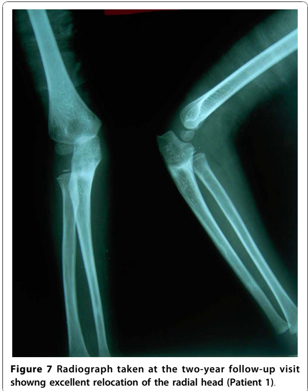
Figure 7 Radiograph taken at the two-year follow-up visit showing excellent relocation of the radial head (Patient 1).

In procedures involving reconstruction around the radial head, it is mandatory to stabilize the radial head by a transcapitellar K wire to prevent redislocation [4,7]. In one study, Hori et al. reported that of the 13 patients treated surgically with open reduction, ulnar osteotomy and annular ligament reconstruction, there were seven re-dislocations, and seven patients had restriction of movement [15]. The authors reported that they achieved better results once they modified the osteotomy procedure, and stressed the need for angulation and elongation of the osteotomy. Rodgers et al. reported 14 complications in seven patients, including problems with the osteotomy site, re-dislocations and nerve injuries [12].