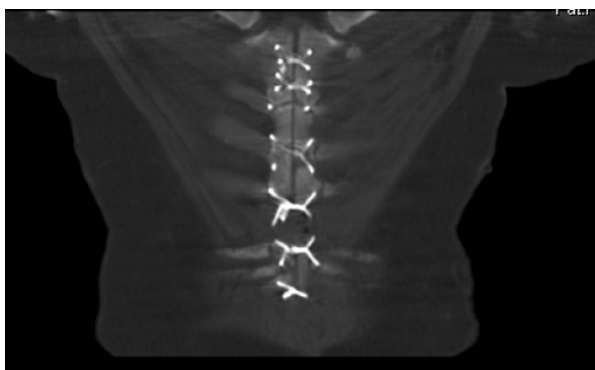
Figure 1 A computed tomography (CT) scan prior to supportive therapy showing sternal non-union (two months after operative refixation).

sternum in a cloak-like manner with a width up to 25 mm, and intact wire stitches (Figure 1). He rejected a repeat surgical wound revision.