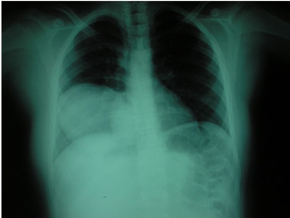
Figure 1 Chest radiograph shows a 9.0 × 8.2 cm homogenous circular opacity in the lower lobe of the right lung.

Serologic test results for echinococcus by means of an enzyme-linked immunosorbent assay and an indirect haemagglutination test were positive.