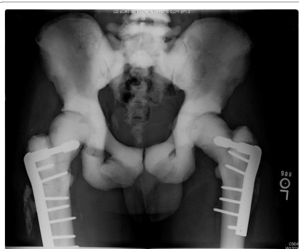
Figure 3 Anteroposterior radiograph of the pelvis at the two-year follow-up appointment demonstrating attenuated but still visible fracture lines on the right side.

Our patient moved out of our geographical area but kept in contact. About three years after his procedures, he contacted our office to request a referral to an orthopaedic surgeon closer to his new area of residence with experience of treating osteopetrosis. He was developing further osteoarthritic hip changes and needed advice