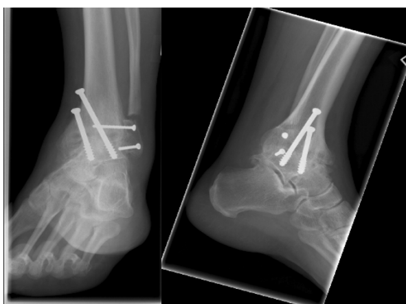
Figure 2 Anteroposterior and lateral views of a fused ankle.