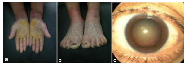
Figure 2 Clinical manifestations of the Tunisian patients with mal de Meleda. (A) and (B) Transgressive keratodermas and palmoplantar erythema resulting in the characteristic 'glove and stocking' distribution. (C) Photograph of our patient III-1 with a total posterior subcapsular cataract.

The father (II-1) of these siblings was affected by multiple extended lesions of his thorax and limbs, with a histological diagnosis of human immunodeficiency virus (HIV)-negative Kaposi's sarcoma confined to his skin since 2004. The disease was clinically severe with bulky and significant lesions covering more than 50% of the surface of the affected areas. Laboratory work-up for extra-cutaneous (lung, digestive tract and ear-nose-throat) lesions was negative. He was intermittently treated with oral and intravenous etoposide, which resulted in minor