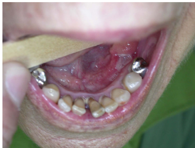
Figure 1 Shallow ulcer with an erythematous border, measuring about 1.5 cm at its maximum diameter, located in the mucosa of the lingual region of the left lower premolars.

Exfoliative cytology of the lesion showed superficial and intermediate pavement epithelial cells presenting diverse inflammatory and degenerative alterations, such as vacuolization, a perinuclear halo, an enlarged nucleus, binucleation and lysis, numerous mono- and polymorphonuclear leukocytes, thick and filamentous