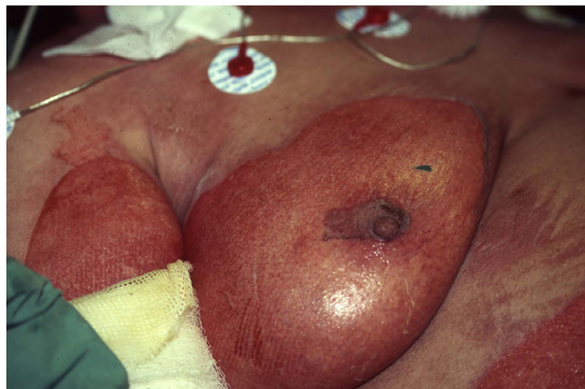
Figure 2 Closer view demonstrating the epidermolysis in the right breast.

treated with intravenous dextrose 5%, and the oral hypoglycemic medications were discontinued. Laboratory studies revealed hypomagnesemia (1.32 mg/dl), for which intravenous MgSO_4 was administered. Local treatment included Vaseline gauze dressings that were changed once a day.