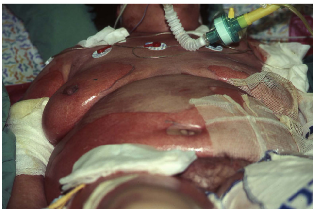
Figure 1 Clinical manifestation of TEN, demonstrating widespread epidermolysis affecting bilateral breast, lower abdomen, and anteromedial aspect of the right arm. The central anterior trunk is not affected.

The final diagnosis was TEN due to ceftriaxone intake. The mucous membranes were not involved. Treatment with intravenous hydrocortisone 500 mg was initiated. The hypoglycemia (glucose level-45 mg/dl) was successfully