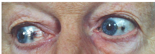
Figure 1 Ochronotic pigment on the sclera of the eyes of the patient.

Alkaptonuria is an autosomal-recessive inherited genetic disorder of the tyrosine metabolism. Considering conserved synteny, the HGO gene could be mapped to chromosome 3q in six alkaptonuria pedigrees of Slovak origin [5]. So far, 67 different mutations in the HGO gene have been identified [6]. The deficiency of HGO results in the accumulation of homogentisic acid followed by an increased excretion of the metabolite [1]. At first, the urine has a normal colour but after a couple of hours it turns dark due to the high level of homogentisic acid. The ochronotic pigment results from oxidative polymerisation of homogentisic acid [7]. We did not perform a biochemical analysis to determine whether the level of homogentisic acid was elevated but diagnosed the disease based on histopathological and clinical examinations.