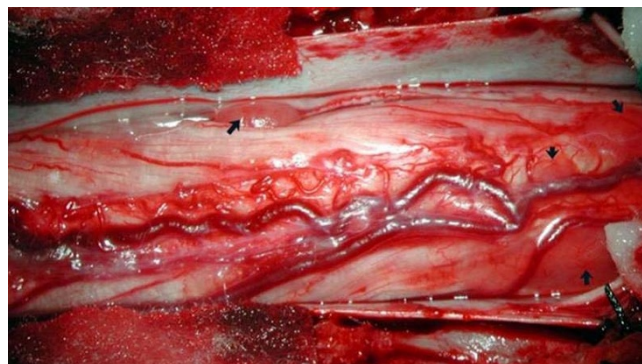
Figure 2 Intraoperative photograph of multiple ependymomas in the region of conus medullaris and cauda equina (arrow).

Spinal ependymomas are rare tumors constituting 1.9% of all CNS tumors and 60% of spinal gliomas [1]. They are commonly seen during the fourth decade of life, and occur more frequently among males, with the majority of cases located in the lumbo-sacral region [1]. Usually intradural, they can be intra- or extramedullary. The conus medullaris and the cauda equina are the most commonly involved sites (95%) of primary spinal ependymomas [1]. Pathologically there are four types of ependymomas, namely: typical, anaplastic, subependymoma and myxopapillary. Among these, mainly anaplastic ependymomas are known to spread to multiple sites in the spine and cra-