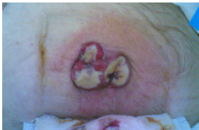
Figure 2 Abdominal erythematous cutaneous swelling. This was situated in the right abdominal wall, in the previous drain site.