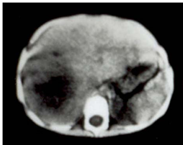
Figure 2 Computed tomography scan of the liver showing the liver abscess.

The clinical presentation of ALA is extremely variable and unpredictable. The usual presentation in children is one of acute illness, with right upper quadrant pain, fever, and tender hepatomegaly. Our patient had a typical presentation but unfortunately was not diagnosed in the early