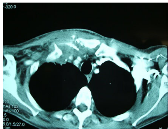
Figure 3 The final computed tomography scan established the correct diagnosis, showing erosive changes within the joint.