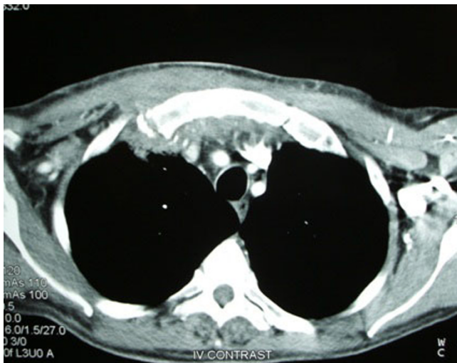
Figure 1 Computed tomography scan showing inflammatory changes behind the right sternoclavicular joint with small pockets of air behind the upper sternum.

organisms were isolated from the aspirate. Nevertheless, because there was still a degree of uncertainty, it was decided to treat the condition with prolonged jejunal feeding and antibiotics. After 2 weeks on this regime, the inflammation resolved completely and the patient was allowed oral feeding and discharged home. However, 9 days after his discharge, the patient presented with the same symptoms. Another CT scan established the diagnosis of septic arthritis showing erosive changes within the right sternoclavicular joint (Figure 3). The patient restarted a 6-week course of the same antibiotic combination but without restrictions in oral intake. Eventually, the