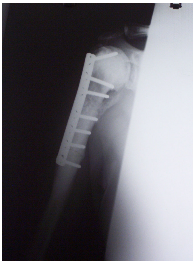
Figure 3 Postoperative X-ray image of fracture after 6 months with healing and good reduction.

been made to use high speed electric drill bits, frequently cooling them and clearing the flutes while drilling and using the graduated drill bit system to overcome drill breakage and over-heating [9,10]. However, after internal fixation, implant failure and non-union are still a major risk [6,8]. We successfully overcame this complication by using Bone Morphogenic Protein (BMP) which plays a crucial role in bone formation by stimulating mesenchymal cells and differentiating them into osteoblasts [11]. BMP has proved to be a very good tool because of its osteoinductive property, resulting in good callus formation and healing of fractures.