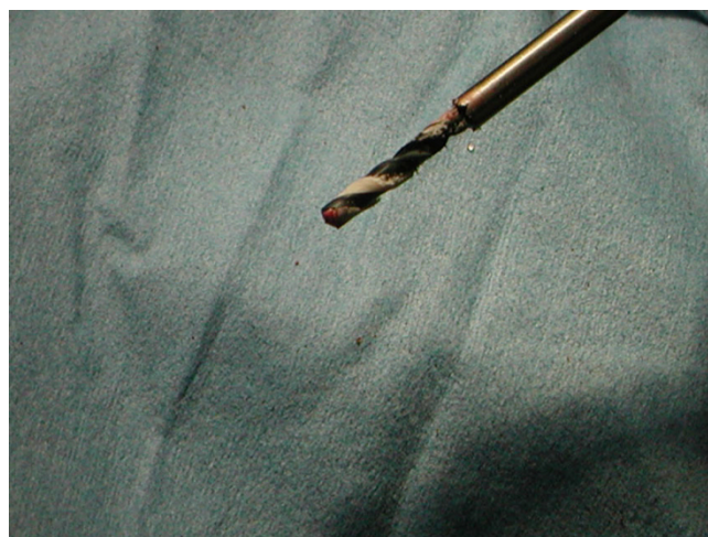
Figure 2 High-speed steel drill bit used for drilling osteopetrotic sclerosed bone.

active assisted mobilisation was started on the second postoperative day. After 3 months, there was good evidence of callus formation and fracture healing (Figure 3) along with a full range of motion at the shoulder joint.