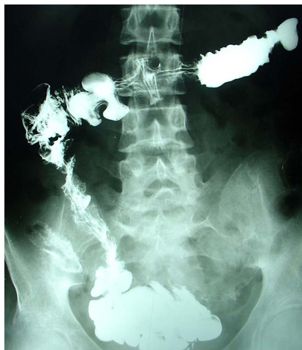
Figure 3 Small bowel series (small bowel transit) shows narrowing and irregularity of the terminal ileum and ulceration in its wall, highly suspicious for tuberculosis.