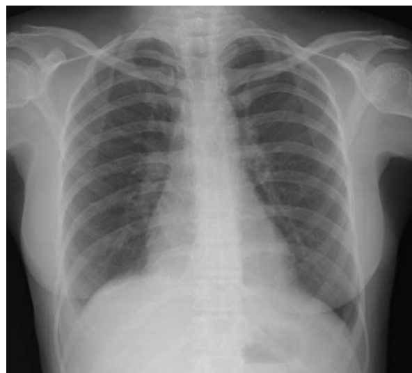
Figure 1 Chest X-ray findings (a) at the time of acute symptoms and (b) after weaning from the ventilator.