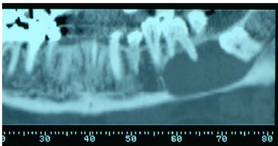
Figure 1 Pre-operative panoramic radiography.

The first diagnostic hypothesis was a third molar follicular cyst. A biopsy was not taken. Surgical treatment consisted of enucleating the lesion preserving the alveolar nerve and extracting the wisdom tooth. Unexpectedly, the lesion presented as a solid, sheet-like mass. At 6 months after resection, all teeth involved maintained vitality.