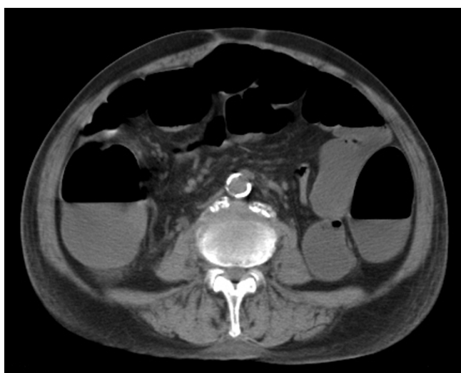
Figure 1 Abdominal computed tomography shows massive large bowel dilatation of the entire colon.

Abdominal computed tomography imaging revealed a massive dilatation of the entire colon (Figure 1). Subsequently, a colonoscopy was performed, which revealed multiple punched-out ulcers in the transverse colon (Figure 2A and 2B) typical for CMV colitis. Following colonoscopy, CMV antigen was detected by indirect enzyme antibody method, also known as antigenemia method, but the biopsy specimens did not reveal CMV inclusion body immunohistologically. Based on these findings, the patient was diagnosed with CMV colitis and was started on intravenous ganciclovir therapy (500 mg/day for 2 weeks) combined with subcutaneous octreotide (200 mcg/day for 10 days). The patient gradually improved, and a second colonoscopy 4 weeks after admission dem-