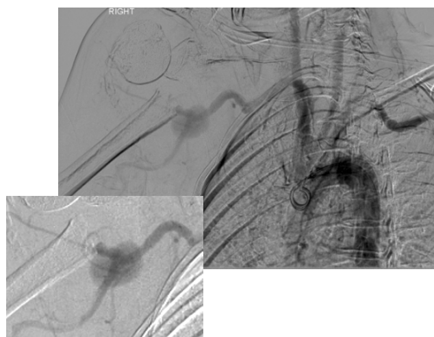
Figure 2 Catheter angiogram depicting pseudoaneurysm formation of third part of axillary artery with complete occlusion of the distal right brachial artery.

Operative treatment was undertaken with initial exposure and control of the subclavian artery above the clavicle (Fig. 3A). Simultaneous exposure of the brachial artery in the antecubital fossa was performed and a size 3 Fogarty embolectomy catheter passed distally down the brachial artery. Both radial and ulnar arteries were found to contain thrombus which was cleared with good back flow. The proximal brachial and distal subclavian arteries were ligated in continuity. Two interconnected Javid™ shunts were inserted to carry blood flow from the subclavian to the brachial artery in order to maintain perfusion (Fig. 3B) during open reduction and internal fixation of the fractured humerus, after which a subclavian to brachial bypass was performed using reversed long saphenous vein. The fracture was temporarily stabilised using external splints to immobilize the limb whilst securing vascular continuity.