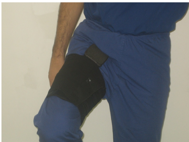
Figure 4 The padded portion of the device hitching against the groin when the hip is flexed beyond 70° and acts as a reminder.

multifactorial, the three main causes for recurrent dislocation are component malposition, soft-tissue deficiency and positional reasons [3]. Component malposition, when identified, can be effectively corrected with revision of the malpositioned component [3,5]. Soft tissue imbalance can be effectively treated with trochanteric transplantation, adjusting the neck length or with constrained acetabular liners [3,5,6]. However, revision surgery is challenging and problems related to further dislocations, premature wear, increased radiolucency, fractures and dislodgement of the liners remain major concerns [7,8].