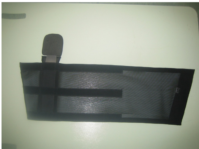
Figure 3 The orthosis (called a 'flexion reminder device') has a simple padded plastic device within an elastic strap with a Velcro fastening.

multifactorial, the three main causes for recurrent dislocation are component malposition, soft-tissue deficiency and positional reasons [3]. Component malposition, when identified, can be effectively corrected with revision of the malpositioned component [3,5]. Soft tissue imbalance can be effectively treated with trochanteric transplantation, adjusting the neck length or with constrained acetabular liners [3,5,6]. However, revision surgery is challenging and problems related to further dislocations, premature wear, increased radiolucency, fractures and dislodgement of the liners remain major concerns [7,8].