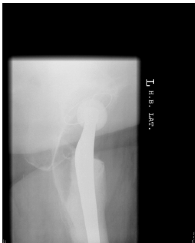
Figure 2 Lateral view of the relocated hip arthroplasty.

was an unguarded flexion of the hip. An abduction brace was prescribed but she could not tolerate wearing it all the time. She suggested having a simple device strapped to her thigh which would physically remind her when she should not flex beyond a limit.