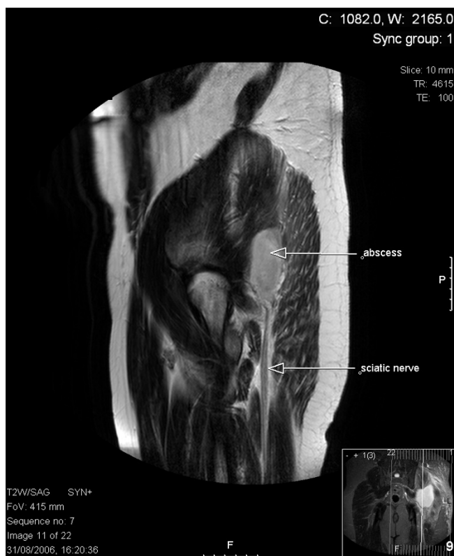
Figure 1 Axial T2 magnetic resonance imaging section through the hip region showing abscess collection in relation to the left sciatic nerve.

The following day, the patient became systemically unwell, in that he became pale, sweaty and tachycardic with low-grade pyrexia. Passive left hip movements were extremely painful, and a palpable area of warmth and induration over the left gluteal region was now evident. Haematological and serological investigation revealed a total leukocyte count of 18.4 (14.0 neutrophils), C-reactive protein of 242 and an erythrocyte sedimentation rate of 40 mm/hour. MRI of the hip and buttock area showed a collection of fluid posterior to the femur, between the gluteus maximus and medius muscles, and pressing upon the sciatic nerve (Figures 1 and 2).