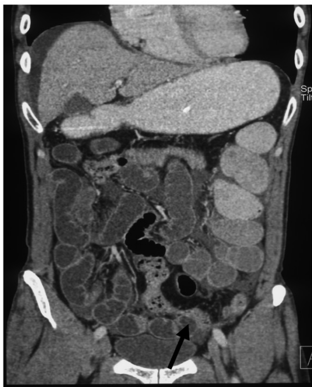
Figure 1: Computed Tomography coronal image demonstrating dilated small bowel loops with a point of transition approximately 10cm from the ileo-caecal valve. (Arrow)

At laparotomy, a mechanical small bowel obstruction due to an incarcerated internal hernia was found. A loop of ileum had herniated through a congenital defect in the sigmoid mesocolon (Figure 2). This was reduced successfully and the defect was approximated with interrupted 3/0 poliglecaprone sutures. The strangulated portion of small bowel was viable. In this case the hernial orifice measured 4 cm and consisted of two leaves of the sigmoid mesentery (Figure 3). No hernial sac was present.