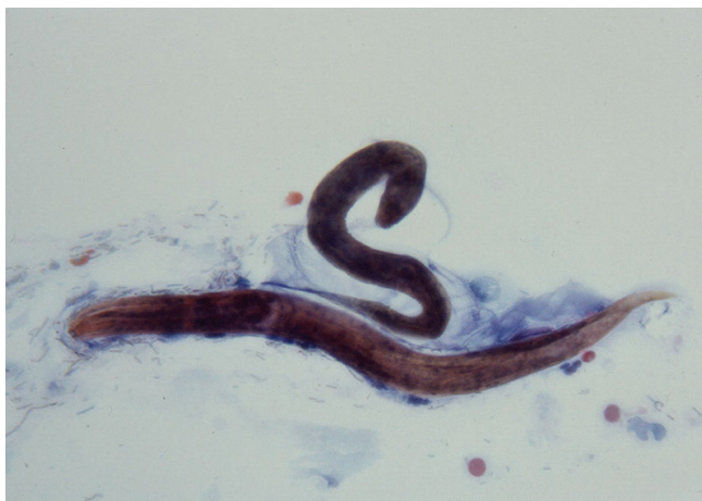
Figure 1 Esophageal brushing revealing the larval form of Strongyloides stercoralis .

temic lupus erythematosus (SLE), and disseminated strongyloidiasis is reported after corticosteroid administration for this disease [8]. Dissemination may involve gut, stomach, lung and/or cerebrospinal fluid [9,10]. Furthermore, larval penetration of the intestinal wall during dissemination may result in bacteremia due to the introduction of bowel flora.