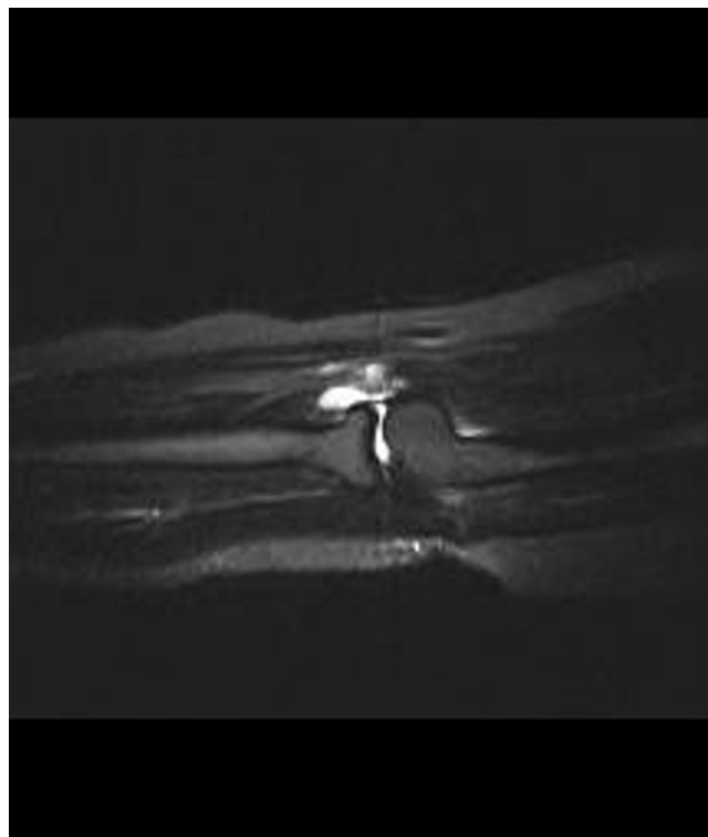
Figure 2 Short T1 inversion recovery fat suppressed sagittal magnetic resonance imaging scan showing a deeper part of the ganglion and its relation to a small effusion in the radiocapitellar joint.

radiocapitellar joint (Figure 3b). Histology of the sample confirmed a multiloculated fibrofatty ganglion cyst with no discernible epithelial lining. The patient was reviewed in the clinic a month later and her symptoms had resolved.