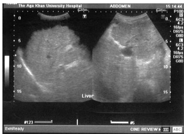
Figure 2 Ultrasound upper abdomen showing coarse liver parenchyma, irregular margins of liver, parahepatic ascities.

showed grade III esophageal varices (Fig 3) and severe portal gastropathy but no gastric varices. Prophylactic banding of esophageal varices was performed on two occasions (at 17 th and 23 rd week of gestation). She was given propranolol 10 mg trice a day and spiranolactone 200 mg daily. She underwent therapeutic paracentesis of massive ascities at 28 th week of gestation. Despite elaborate preparation for a planned vaginal delivery under controlled circumstances, the patient underwent an unanticipated rapid labor and delivered a baby boy at a local facility near her home during the 36 th gestational week.