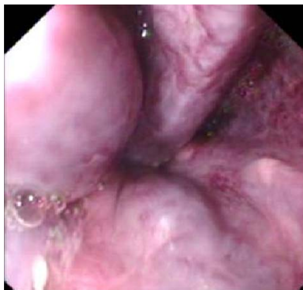
Figure 3 Endoscopic view of large esophageal varices with cherry red spots.

The patient and the baby did not have any complications in the postpartum period. Her ascites was controlled with diuretics. Surveillance endoscopy performed one year following delivery showed small esophageal varices and mild portal gastropathy. The baby was given active and passive immunization against hepatitis B. At the age of 18 months the baby's blood was tested for hepatitis B and C. Serology showed undetectable Anti-HCV antibody and Anti-HDV Ig-G. However, HBsAg was found to be positive with normal ALT and undetectable HBV DNA.