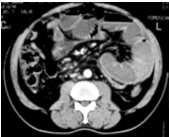
Figure 1 Abdominal CT showing small bowel obstruction.

no evidence of tuberculomas, ascites or other acute or chronic inflammatory changes. Adhesions were the apparent cause of intestinal obstruction. The aetiology of these was not however clear, nor that of the fistulae between the jejunal loops. Absence of previous abdominal surgery or other abdominal insult favoured an 'idiopathic' origin of these lesions, although treated TB may have been the underlying cause. We do not know if it was necessary to divide all or any of the fistulous bridges between the jejunal loops. However, in view of the rarity of the findings and lack of previous experience with such a case, it was felt that leaving these fistulae intact might result in further obstructive episodes due to internal herniation and incarceration.