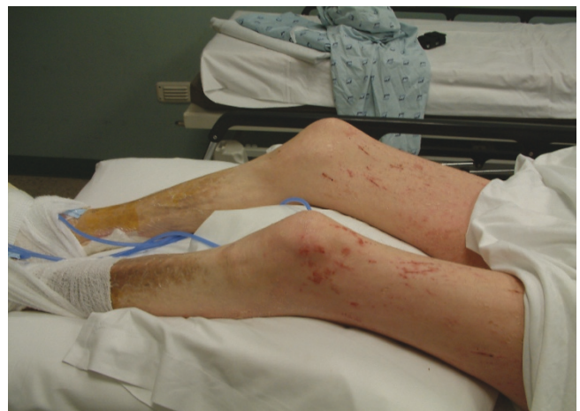
Figure 8. Patient 2 after treatment with hyperbaric oxygen (Side View Legs).