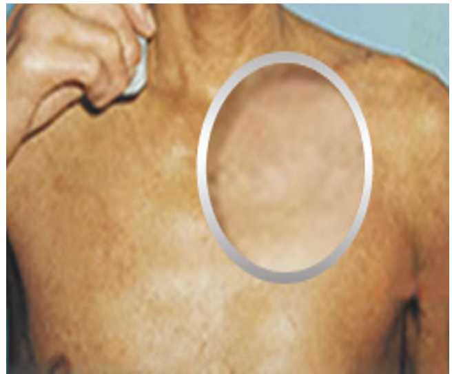
Figure 2. Patient I after treatment with hyperbaric oxygen (Front View).

immunosuppressive drugs supports the view that activated T cells are pathogenic effectors of psoriasis [10]. Dendritic cells are found in psoriatic skin lesions, producing interleukin (IL)-12 and IL-23. Cytokine changes in psoriatic lesions consist of elevated levels of interferon- \gamma , tumor necrosis factor (TNF)- \alpha , numerous interleukins (such as IL-1, IL-2, IL-6, IL-8, IL-12, IL-17, and IL-19), and multiple chemokines (MIG/CXCL9, IP-10/CXCL10, I-TAC/CXCL11, and MIP3 \alpha /CCL20) [11]. IL-12 p40 mRNA and expression of interferon- \gamma , inducible nitric