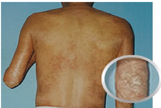
Figure 3. Patient I before treatment with hyperbaric oxygen (Back View).

Leukocytes, cytokines, and keratinocyte growth or differentiation abnormalities are involved in psoriatic skin lesions. Psoriasis vulgaris is a T-cell-driven disease, with type I (interferon- \gamma -producing) T cells predominating in skin lesions [10,11]. A lymphocytic infiltrate in psoriasis plaques consists of a mixture of activated CD4 + and CD8 + T cells; the latter predominate in lesional epidermis and CD4 + cells in the dermis [12]. The therapeutic benefit of