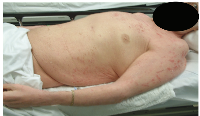
Figure 6. Patient 2 after treatment with hyperbaric oxygen (Side View Torso).

oxide synthase, B7-1, and TNF- \alpha are elevated in psoriatic tissue [11]. A rheumatoid-like pattern has been identified as one of the most common types of psoriatic arthritis. Autoantibodies directed against nuclear antigens, cytokeratins, epidermal keratins, and heat shock proteins have also been reported in psoriatic arthritis.