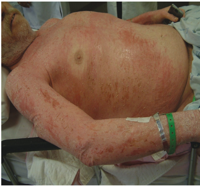
Figure 5. Patient 2 before treatment with hyperbaric oxygen (Side View Torso).