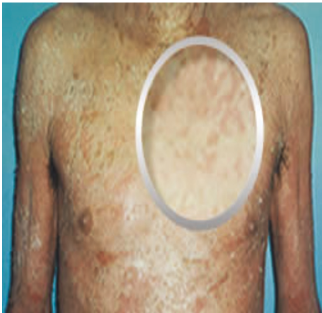
Figure 1. Patient I before treatment with hyperbaric oxygen (Front View).

two patients. No adverse effects were reported during or after treatment with HBO 2 .