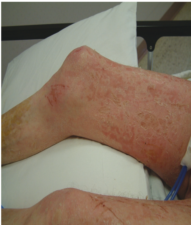
Figure 7. Patient 2 before treatment with hyperbaric oxygen (Side View Legs).

HBO 2 suppresses the proliferation of macrophages and the formation of foam cells in atherosclerotic lesions [12]. HBO 2 also intensifies the suppressive function of T lymphocytes, normalizes cell-bound immunity, and decreases the serum concentration in immune complexes [13]. The immunosuppressive effects of HBO 2 include suppression of autoimmune symptoms, decreased production of IL-1 and CD4 + cells, and increased percentage and absolute number of CD8 + cells [9]. In addition, long-term HBO 2 exposure suppresses development of autoimmune symptoms such as proteinuria, facial erythema,