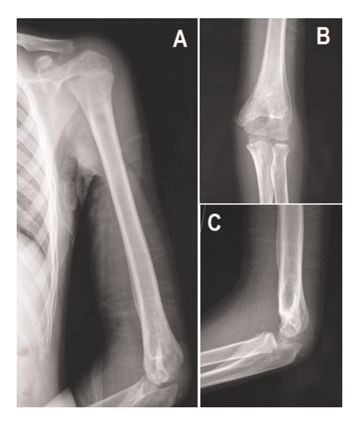
Figure 3. Postoperative roentgenograms of (A) left upper extremity and (B, C) left elbow at six months.

humerus fracture. However, they could not achieve closed reduction for the supracondylar humerus fracture due to the combination of fractures in the same extremity and resulting instability. Therefore, they performed open reduction.