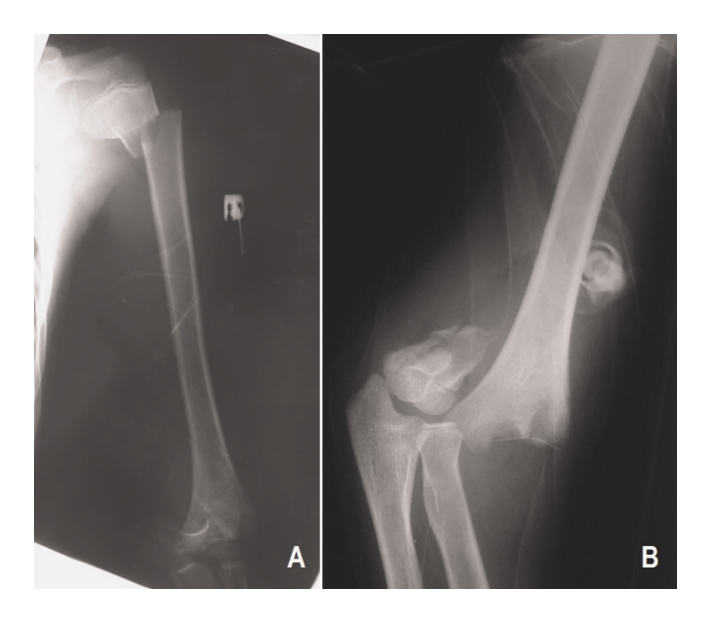
Figure I. Preoperative (A) anteroposterior roentgenogram of the left upper extremity and (B) lateral roentgenogram of the left elbow.

Under general anesthesia, closed reduction of the supracondylar humerus fracture was initially attempted under fluoroscopic control. However, it could not be achieved with manipulation because it was difficult to perform closed reduction on the severely swollen upper limb. A 3 mm temporary Kirschner wire was inserted to the humeral shaft from the lateral to medial direction. With the assistance of this "joystick" Kirschner wire, the humeral shaft was manipulated easily and closed reduction and percutaneous fixation with three Kirschner wires were performed. Once the supracondylar humerus fracture was stabilized, the management of the proximal humerus fracture was relatively straightforward. Closed reduction